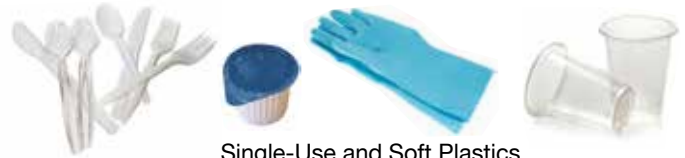
Single-Use and Soft Plastics