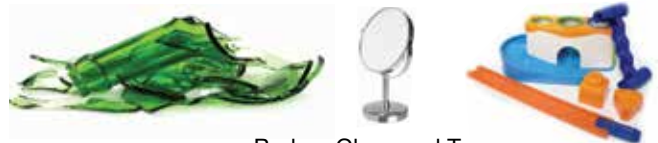
Broken Glass and Toys