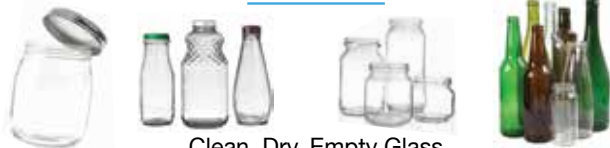
Clean, Dry, Empty Glass