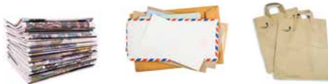
Clean, Dry, Loose Papers