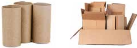
Clean, Dry, Loose Cardboard