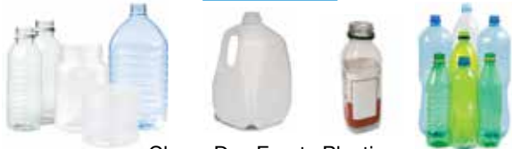
Clean, Dry, Empty Plastics